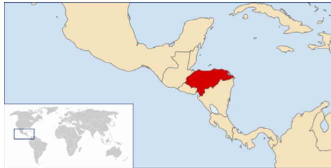
Figure 3: Honduras in Central America

Because of the reliance on crops, it appears that the amount of land a household has available for agriculture would be a better suited proxy for productivity in this case. Hondurans would be more likely to reinvest their profits in land than in livestock because it is more productive, given that the livestock trade is not as great as it is in the other countries examined. Of course, trading land is more difficult than trading livestock and land quality is also far more heterogeneous, but that is the nature of the Latin American setting. Negating this, however, is the fact that Honduras reformed its laws to improve the ease with which land can be transacted. The Agricultural Modernization Law, passed in 1992, improved the way in which land was titled, and allowed land that was previously owned by cooperatives to be broken up into smaller personal plots that could be bought and sold.