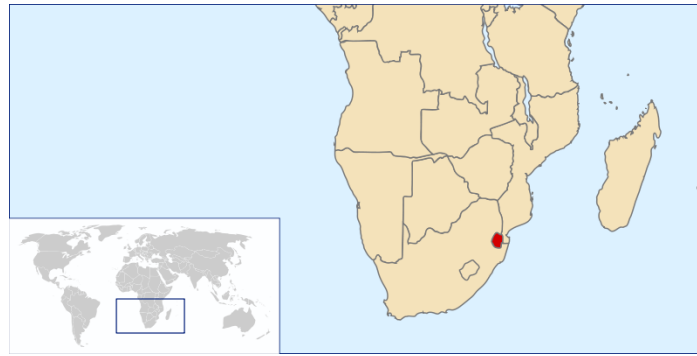
Figure 1: Swaziland in southern Africa