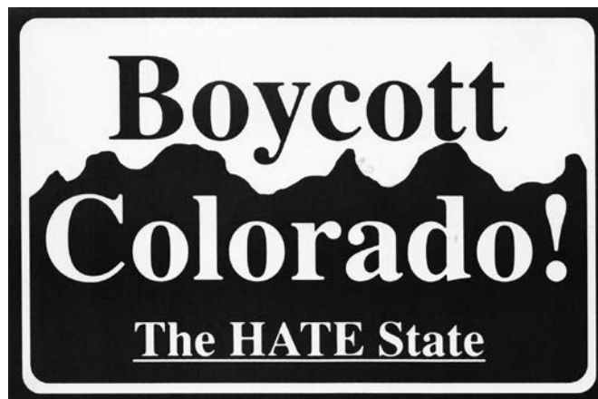
Figure 2. Boycott Colorado was formed as a way to fight back against attacks on anti-discrimination laws.

More importantly, the boycott took a serious toll on Colorado's reputation. From innumerable newspaper articles and other publicity, Colorado acquired the epithet "The Hate State." Within the state, many companies and individuals did what they could to counteract this. They adopted and publicized nondiscrimination policies covering sexual orientation, and some required any vendors they did business with to adopt similar policies. Among these efforts was the Colorado Alliance for Restoring Equality, a Denver-based group of businesses and community groups devoted to overturning Amendment 2 [26].