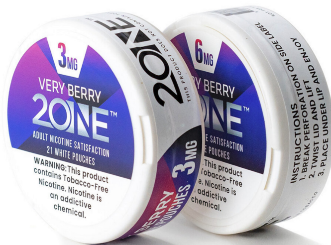
Figure 1 Products containing synthetic nicotine. (A) Puffbar line of electronic cigarettes containing synthetic nicotine, marketed since February 2021. (B) Next Generation Labs' description of synthetic nicotine. (C) 20ne nicotine pouches with warning label stating synthetic nicotine content, available for ordering on Amazon.com.

N-vinyl-2-pyrrolidinone to form myosmine, a tobacco alkaloid. Myosmine is reduced to nornicotine, followed by a methylation step resulting in a racemic (50/50) mixture of the nicotine stereoisomers, (S)-nicotine and (R)-nicotine. 16 NGL's intellectual property was recently recognised by Chinese authorities, enabling the company to enforce its patents in the country where the large majority of E-cigarette products are manufactured. 17 At least four other US-based E-cigarette vendors were identified