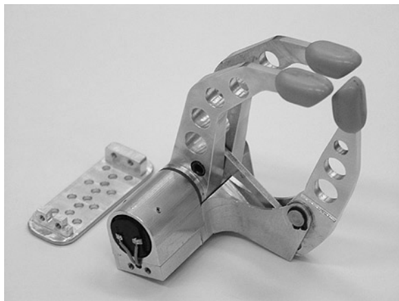
Figure 1. Prototype hand mechanism with socket mounting plate.

The hand mechanism is shown in Figure 1. It uses a single motor with a gear transmission and bi-directional backlock [1]. The motor and transmission are placed in the volume corresponding to the knuckles of the ring and little finger. The finger assembly is made up of the index and middle fingers machined as a unit and a separate thumb. The fingers are driven by the gear transmission and a linkage transfers movement of the finger unit to movement of the thumb. Using a 9-volt rechargeable battery, the fingers have a maximum speed of about 2 radians/sec ( \approx 105^\circ/\text{sec} ) with a maximum grip force at the tips of about 53 N ( \approx 12 \text{ lb}_f ).