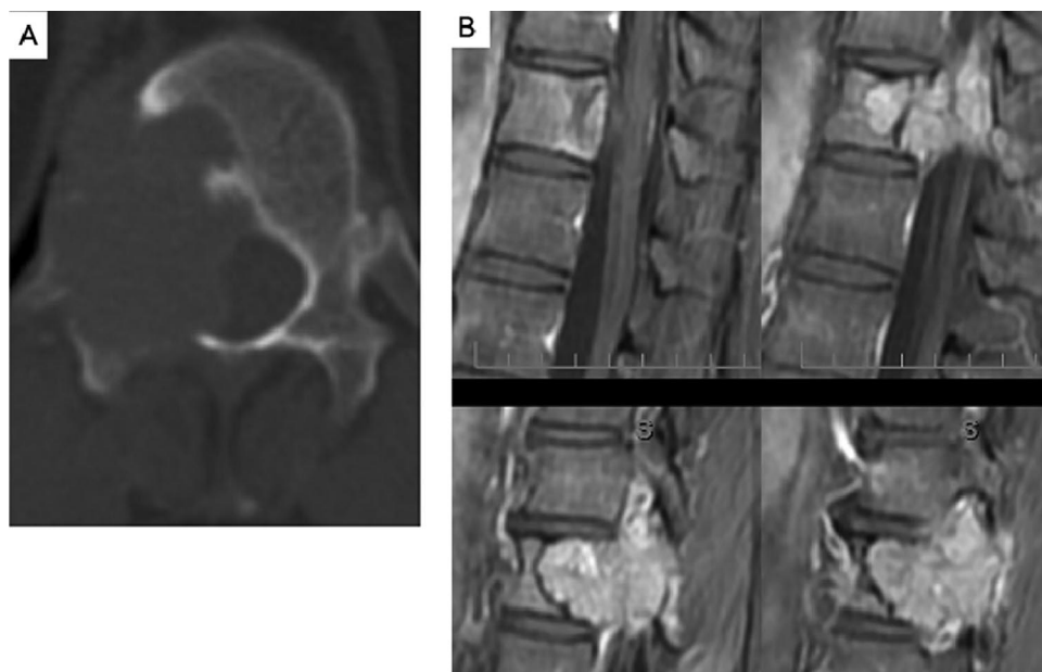
Figure 3. A , Axial CT scan demonstrating lytic lesion of T10 involving severe destruction of the right pedicle. B , Multiple sequential sagittal magnetic resonance images of the metastatic renal cell lesion in T10.

and right T10 radicular pain. His pain occurred at night while supine or during the day but did not particularly change with posture. His radiographic studies are shown in Figure 3.