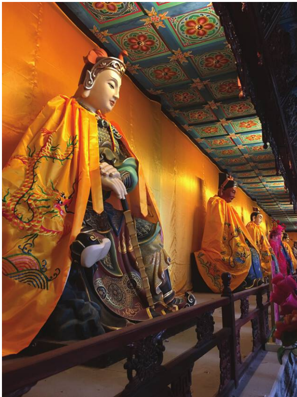
Figure 3. Standardized gods.

spirit mediums and urban-planning temples have moved opportunistically into the open spaces of the disturbed environment, and they have developed an unexpected and unplanned symbiosis, creating a new ecosystem out of their plural ecologies.