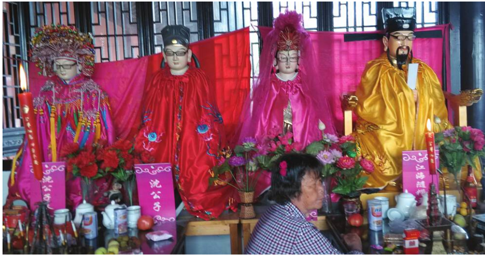
Figure 6. Deities with eyeglasses.

erected temple, most of the deities' former bodies were buried underground and their previous abodes were destroyed. They now have to share their space with other deities or, worse still, suffer being crammed into the basement of a temple. As a result, the spirit mediums became all the more prevalent as channels through which those gods communicate with the people. At the same time, temple-based clergy rely on incense heads, because they lead followers to the temple. This interaction has fostered an unusual new symbiosis that has become possible only because these highly disturbed ecosystems have created new environments with new opportunities for the interaction of plural ecologies—the spirit mediums' practical interactions with gods and ghosts, and the orderly religiosity fostered by the urban planning process. There had been earlier forms of symbiosis, in this region especially between Daoists and local incense heads, but its specific forms are now very different due to the combination of the destruction of the village communities and the remaking of Daoism under Communist political control (Goossaert 2015). This is the same process that we see when biological studies of disturbed ecosystems talk about one succession state replacing another.