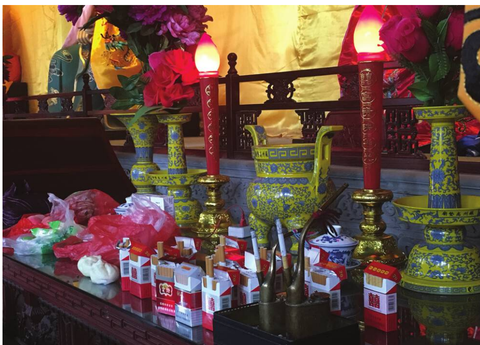
Figure 5. Altar with cigarettes.

10 cigarettes before getting possessed, and others have to burn a whole pack as offerings to their deities daily. No informants could give us a clear idea where and when this use of cigarettes started. Most of them just claim it was a demand from the deity. Cigarettes as offerings have occasionally been reported elsewhere in China, although they are used in rather different ways (usually for ancestors or ghosts). 21 That is, drawing some kind of parallel between cigarettes and incense seems like a latent possibility in Chinese practice, but one that is only occasionally realized, just as certain phenotypes will not appear unless environmental conditions change.