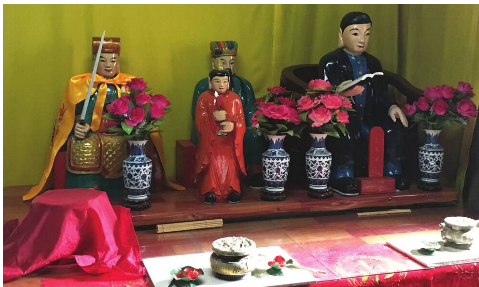
Figure 4. Incense head altar.

We can see another sort of manifestation of the latent in the use of tobacco. Unlike most of China, cigarettes are everywhere on the altars of these two new temples (fig. 5). Methods of using them as offerings have not yet become very conventional. Some people place an entire pack on the altar table. Some stand a single lit cigarette on end, as if it were a stick of incense. Some balance the cigarettes—just a single one or sometimes the contents of an entire pack—on the edge of the table and set them alight. A few people stand them in antique water pipes while they burn down. Some spirit mediums smoke five to