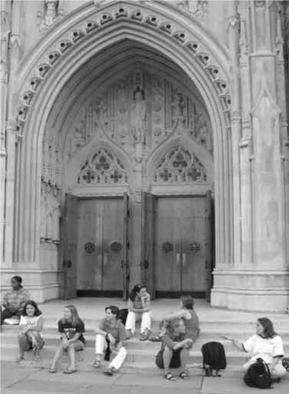
Duke Youth Academy for Christian Formation on the Chapel steps.