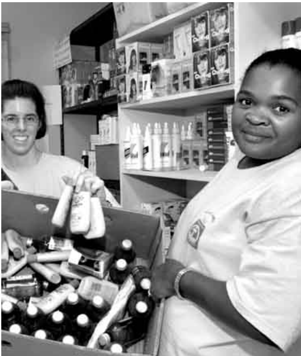
Divinity students help organize items at Urban Ministries of Durham during Project Bri(ddd)ge.