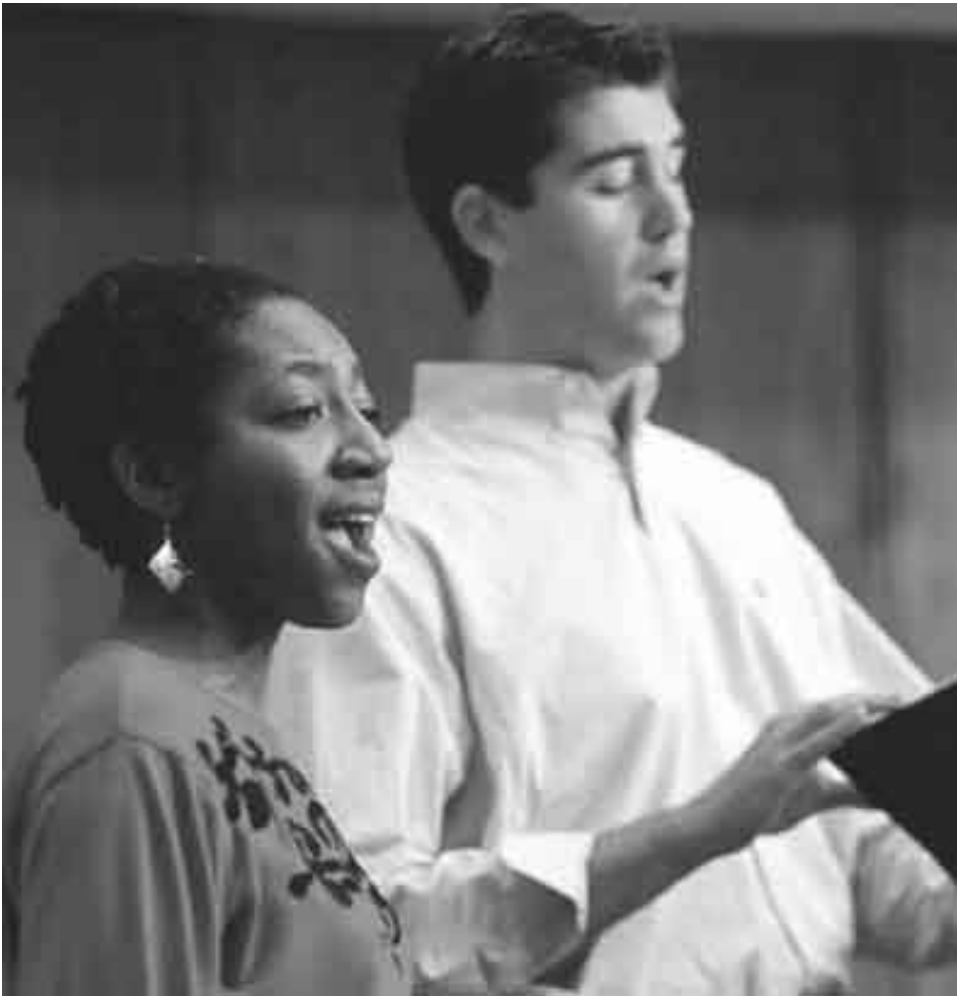
Live at the Lampstand.

International students must, in addition to the information required of all students, submit the following with the application materials: (1) If the student's native language is not English, certification of English proficiency must be demonstrated by scores from the Test of English as a Foreign Language (TOEFL). Applicants to the M.Div. and M.C.M. degrees must also submit scores from the Test of Spoken English (TSE). Both tests are administered through the Educational Testing Service in Princeton, New Jersey. The Divinity School requires a TOEFL score of at least 580 on the paper-based test, or 237 on the computer-based test, and a TSE score of at least 50. An international student who completes an undergraduate degree at an accredited college/university in the United States may be allowed to waive these tests. (2) A statement of endorsement must be sent from an official (bishop, general secretary, etc.) of the student's native ecclesiastical body, affirming that ecclesiastical body's support for the student's pursuit of theological studies in the United States and welcoming the student into active ministry under its jurisdiction following the student's study in this country. (3) The Divinity School must have a statement demonstrating financial arrangements for the proposed term at the Divinity School. (Estimated minimum expenses per academic year for a single international student are $26,351 (see section on financial information).