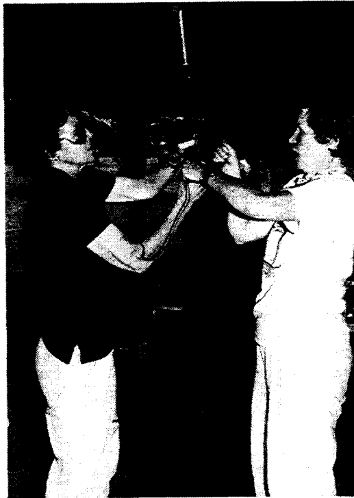
Fig. 2. Weighing a howler. A string is looped around the ankles and hooked onto the scale.

Corp., Costa Mesa, Calif., USA). This aluminum pole comes in 1.75-meter sections which can be bolted together until it is long enough to reach the darted animal. The pole has been used to reach animals 25 m up in trees.