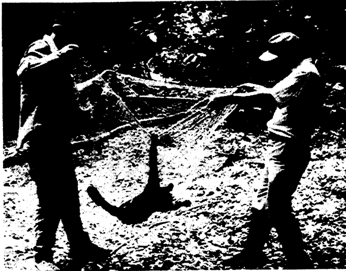
Fig. 1. A campers' hammock measuring 2 m wide by 2.5 m long is effective in catching darted animals as they free-fall from the trees.