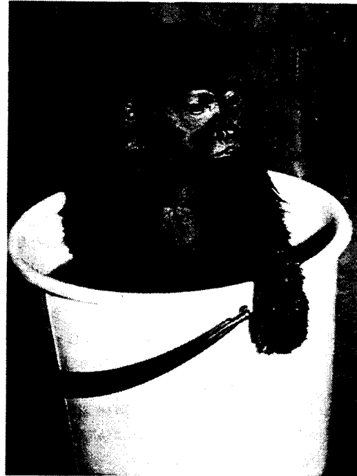
Fig. 6. A female mantled howler being cooled down in a bucket of water. At this recovery stage the drug has worn off enough to allow some body control but not enough to permit escape.

In terms of recovery time, Ketaset is the preferred capture drug for capuchins, as in