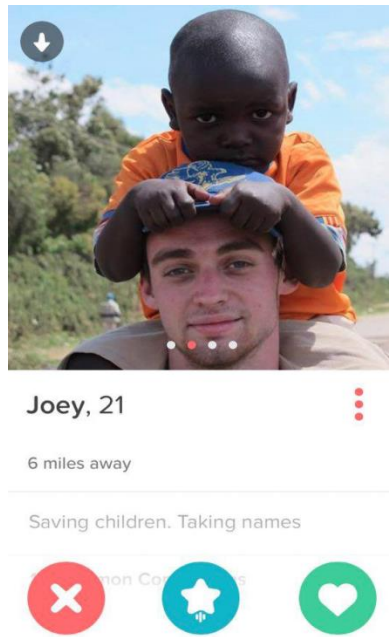
A Photo from a personal profile on Tinder, found on the Humanitarians of Tinder Tumblr.