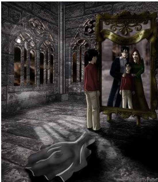
Figure 4- Harry in front of the Mirror of Erised