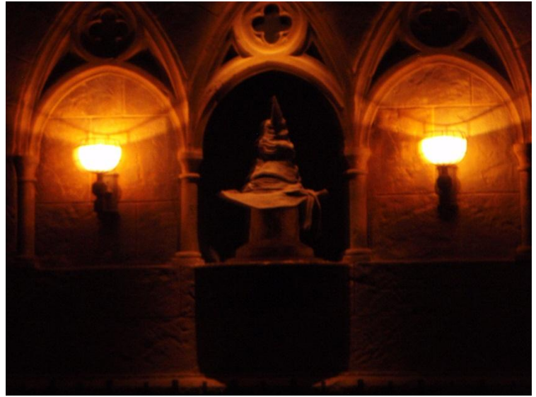
Figure 6- The "Sorting Hat"

After about 250 yards of tunnels snaking through a seemingly endless underground dungeon area, the girls emerged into the hot, sunlit, outdoor part of the line, in the “greenhouses”. They were immediately greeted by a woman, also costumed and speaking in a thick, fake British accent, who asked if they