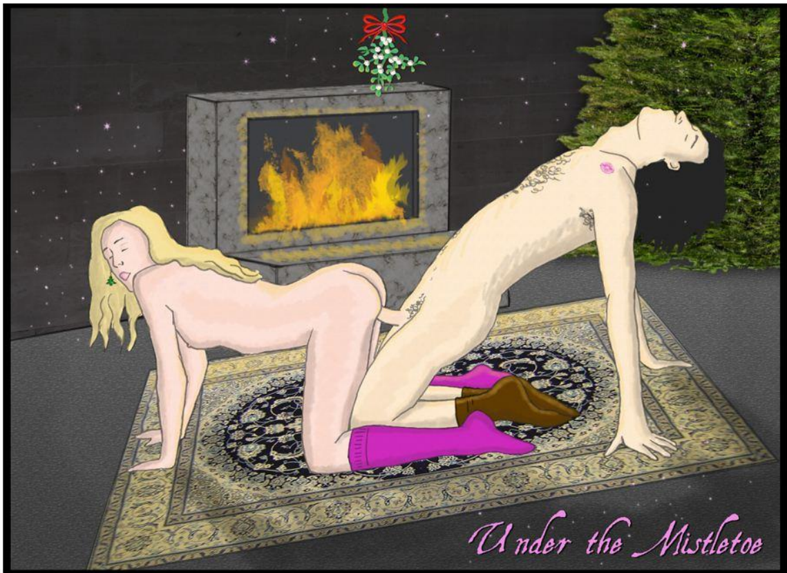
Figure 2- Under the Mistletoe, or How the Nargles Smutted Christmas

This work of art depicts Professor Severus Snape and Luna Lovegood enjoying an intimate moment in front of a fire around Christmastime. The white dots around their heads and torsos are supposed to be Nargles, creatures Luna believes infest mistletoe and steal things. To an unseasoned consumer of sexually explicit fan fiction, this image is likely shocking both for the clumsily rendered portrayal of vaginal intercourse and the fact that this sex act occurs between characters who are a professor and a student in the books.