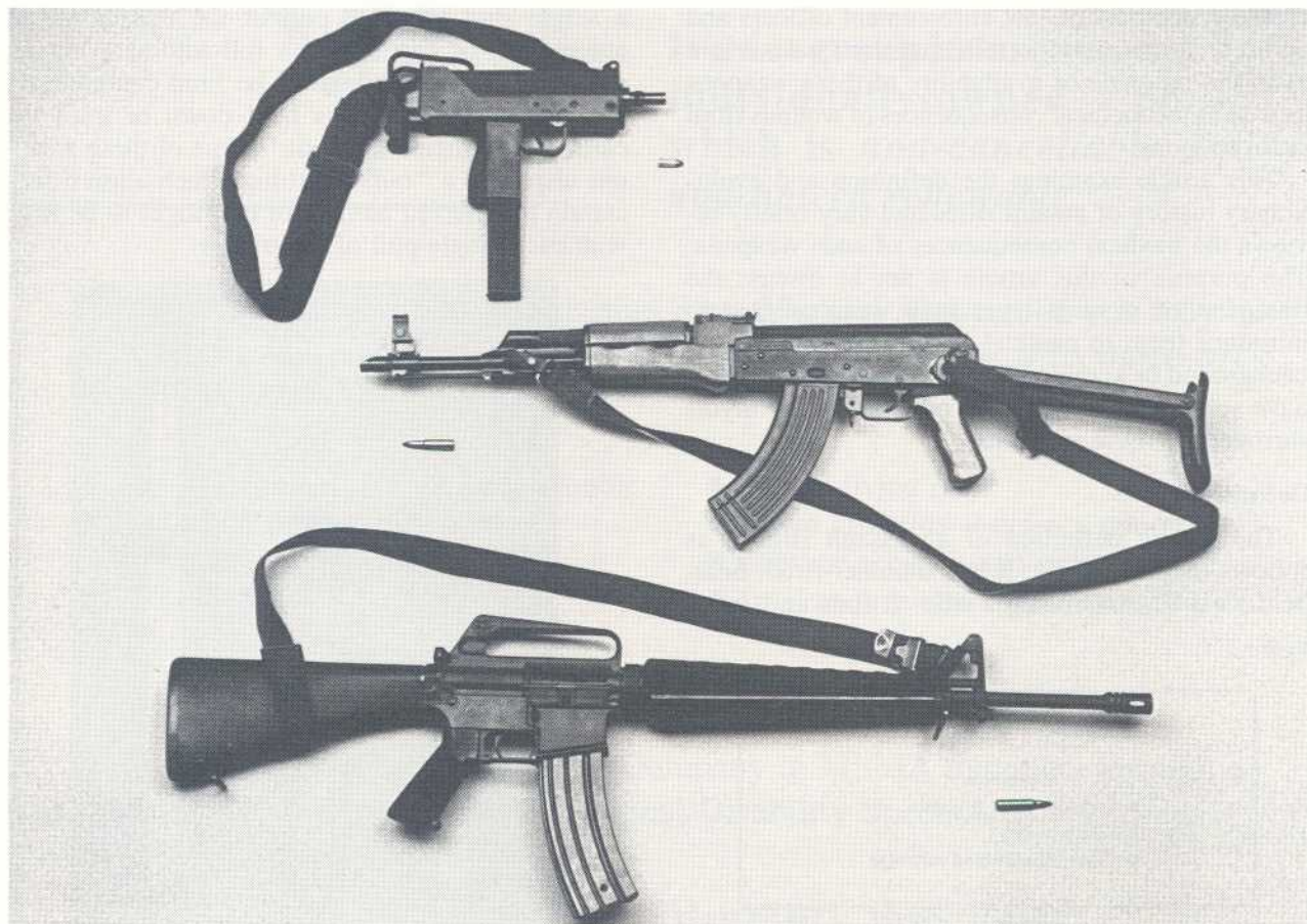
Figure 3. Semi-automatic "look-alike" rifles and pistols

Technically speaking the first assault rifle by definition was a weapon designed by Federov in 1912 and adopted by the Russian army in 1916 as the Federov Avtomat (FA-16). 1,2 Interestingly, it fired