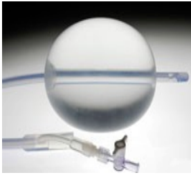
The Bakri Balloon, $250 per device