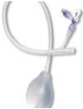
BT- Cath, $200