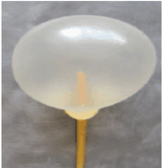
The Rusch Hydrostatic Balloon, $77