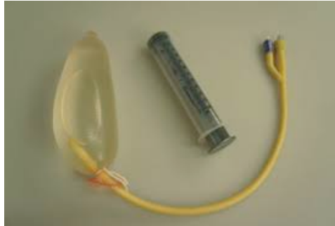
Figure 2: The UBT in the form of a condom tamponade (Tindell et al. 2013)

received condoms free of charge from the Indian government, making the condom catheter balloon a feasible option to address postpartum hemorrhage.