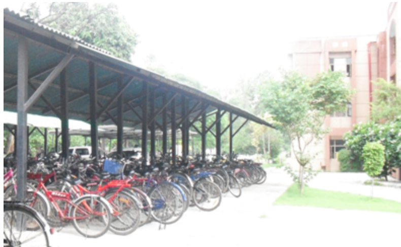
Figure 12: Covered bicycle parking on the school grounds for students at a particular school in the sample. At this particular school, there were over 100 cycles parked at the time of auditing (Table 4).

One school had covered cycle parking, which is shown in Figure 12 below. Many students at this school utilized their bicycles. More schools had uncovered cycle parking (56.25%, Table 4). Usually, there was no special infrastructure or markings for the uncovered cycle parking.