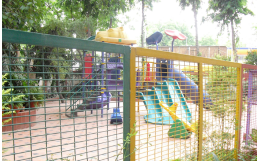
Figure 9: An example of ‘Good’ modal quality playground equipment at one school from the sample. There are slides, swings, and other play equipment for children. Also, there are trees surrounding the entire play area making the play area more appealing and also provides shading. Also, there is fencing around the entire area so children feel secure while playing; additionally, teachers feel secure allowing children to play freely.

playground equipment is generally present for students in the primary schools, for schools that had equipment available, adolescents were seen utilizing the equipment and area.