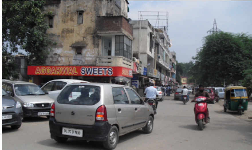
Figure 5: An example of a mixture of business/retail and residential areas. This photograph was taken from the front entrance of a school. Here, the ground floor consists of the business/retail while the upper floors are areas of residences. For example, there is a sweet store on the ground floor here, which is a business/retail. The upper levels are residences. 20% of schools were located in this type of area. In this photograph, it is also important to note the high traffic levels in front of the school.