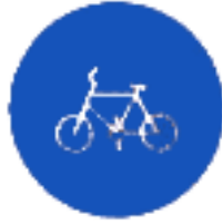
Compulsory Cycle Track