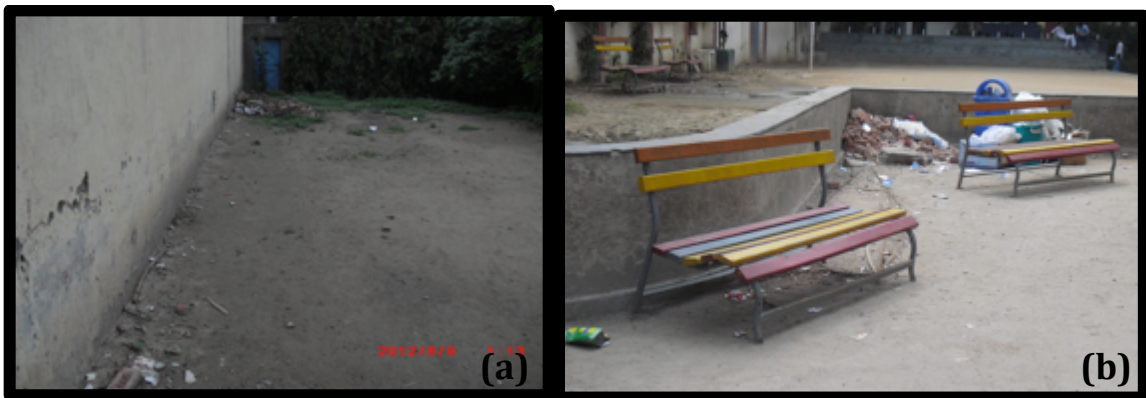
Figure 17: (a) Hard surface play area with some litter and (b) another hard surface playground (with two levels and benches) that have some litter. Both are areas that students utilize for general play.