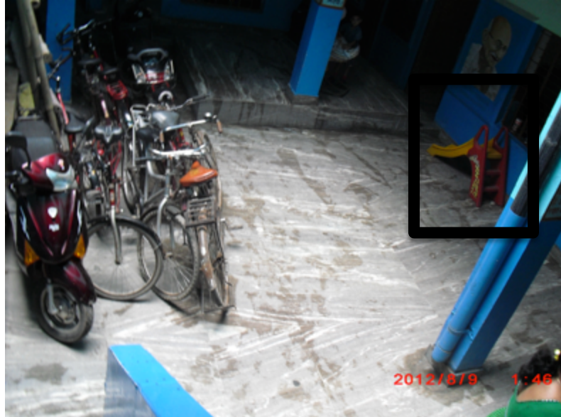
Figure 10: An example of ‘Poor’ modal quality playground equipment at one school from the sample. This equipment was located inside the quadrangle of the school and consisted of only one small slide highlighted by the black box (inset). It is important to note that the small size of the slide, which indicates that the older children would not play with this equipment since it is aimed for the younger children. Also, notice the quantity, there is only one.

Also, on average, there was about one court present per school; however, 43.75% of schools did not have any (Table 4). For the schools that did have a court present, it was usually in ‘Good’ modal quality. Figure 10 shows a large basketball court within a large quadrangle at one particular school. 56.25% of schools had quadrangles present (Table 4).