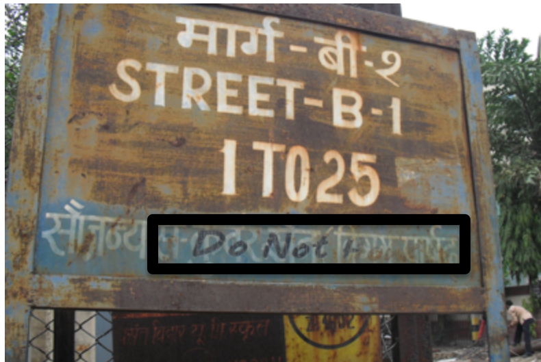
Figure 8: This is a street sign in front of the school. The black box (inset) highlights the faded words ‘Do Not Horn’. This was not recorded as signage on the audit tool because this informal sign is not recognized by the Delhi police; however, it does indicate that people concerned about horns in areas where schools are present despite the actual visibility of Delhi police recognized signs.

None of the schools sampled had any signage including school warning signs for road users, road safety signs, or route signs for cyclists (Table 1). However, one school did mention in faded letters, “Do Not Horn” on a larger street sign. This was not formally recorded on the audit tool because this is not a sign recognized by the Delhi police ( http://www.delhipolice.nic.in/ , Appendix B) (Figure 8).