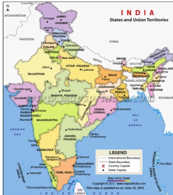
Figure 1. Map of India.

Delhi is made up of nine districts: Northwest, Northeast, North, East, West, Southwest, South, Central, and New Delhi (Figure 2). It is important to note that the Department of Education in India defines twelve districts which include: East, Northeast, North, Northwest A, Northwest B, West A, West B, Southwest A, Southwest B, South, New Delhi, and Central.