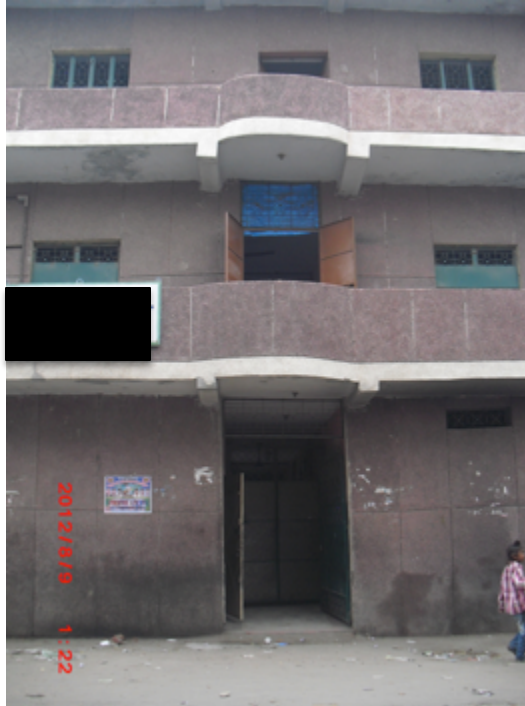
Figure 13: A school from the sample that had no school grounds. The main entrance of the school, shown on the ground floor center, opened directly to the street. Two school reception staff members, during initial communication with the schools, refused to participate citing lack of school grounds at school site as shown here.

One school had an outdoor yoga platform shown below in Figure 14. Also, many school reception staff and principals mentioned the presence of yoga rooms and yoga instruction inside the school during school hours. The audit tool could not formally record these mentioned facilities since the tool is designed to measure only the outdoor grounds. The emphasis on yoga shows the importance of this activity in India.