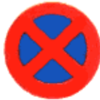
No Stopping or Standing

c. Route signs for cyclists are signs directing cyclists along specific routes