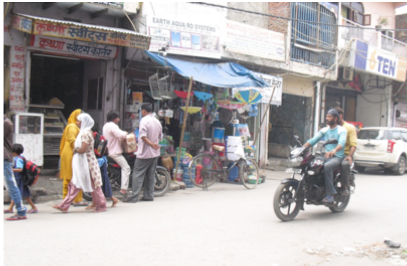
Figure 4: An example of a business/retail area. This photograph was taken from the front entrance of a school. 20% of schools were surrounded by businesses and/or retail.