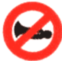
Horn Prohibited