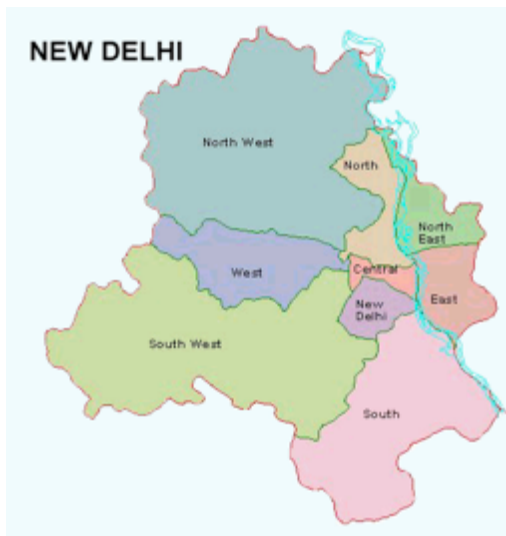
Figure 2: Map of all the Delhi districts ( http://www.newdelhischools.co.in/ ) in India. The nine districts are: Northwest, Northeast, North, East, West, Southwest, South, Central, and New Delhi.

It is the second largest urban center in India, after Mumbai, and the eighth most populated city in the world with a population of over 16,753,235, a number that is only growing (2011 India Census, Government of India). There are about 243 million adolescents in India (2011 India Census, Government of India), which is why a long-term preventative measure should focus on reducing the modifiable risk factors associated with NCDs in adolescents who reside in these large urban centers.