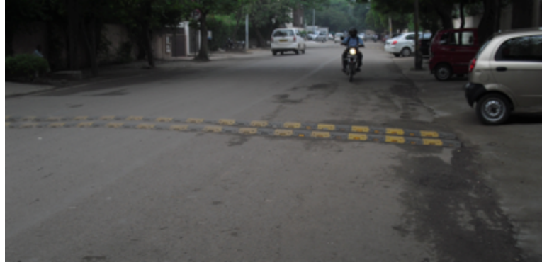
Figure 7: Speed bump, an example of traffic calming, in the front of a school.

None of the schools sampled had any signage including school warning signs for road users, road safety signs, or route signs for cyclists (Table 1). However, one school did mention in faded letters, “Do Not Horn” on a larger street sign. This was not formally recorded on the audit tool because this is not a sign recognized by the Delhi police ( http://www.delhipolice.nic.in/ , Appendix B) (Figure 8).