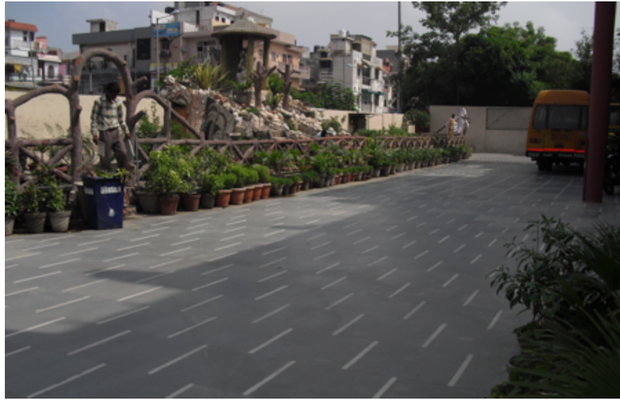
Figure 16: Well-maintained school grounds with no litter.