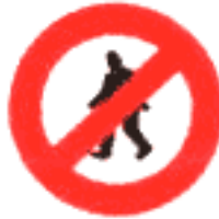
Pedestrians Prohibited

c. Route signs for cyclists are signs directing cyclists along specific routes