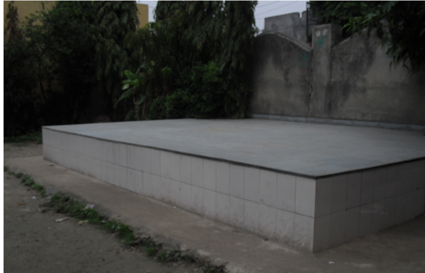
Figure 14: Outdoor yoga platform at one school. This platform was present in the back of the school. Yoga is very common in Indian culture.