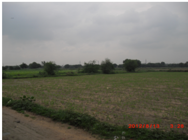
Figure 6: An example of open field areas. This photograph was taken from the front entrance of a school. Farming took place in this particular open field. Here, it is evident that there were hardly any cars, trucks, and motorcycles meaning very low levels of traffic and very low levels of loud noises.