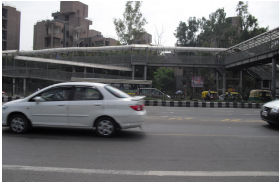
Figure 15: Busy and loud due to large amounts of traffic in front of a school's main entrance.

schools with some or a lot of ambient noise came from high levels of traffic on the surrounding streets of the school; Figure 15 shows an example of a busy and loud street that was directly in front of a school.