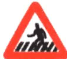
Pedestrian Crossing