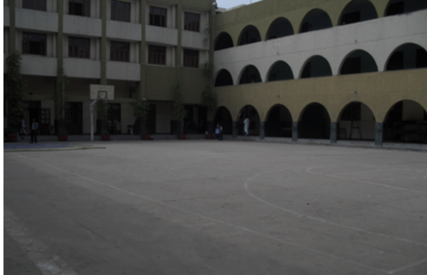
Figure 11: An example of both a basketball court and a quadrangle at a sampled school. At this particular school, the quadrangle contained a basketball court. In addition to basketball, students at this school and others also participated in various activities such as karate, cricket, and yoga in the quadrangle.

One school had covered cycle parking, which is shown in Figure 12 below. Many students at this school utilized their bicycles. More schools had uncovered cycle parking (56.25%, Table 4). Usually, there was no special infrastructure or markings for the uncovered cycle parking.