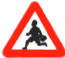
School Ahead Sign (cautionary sign)