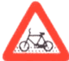
Cycle Crossing