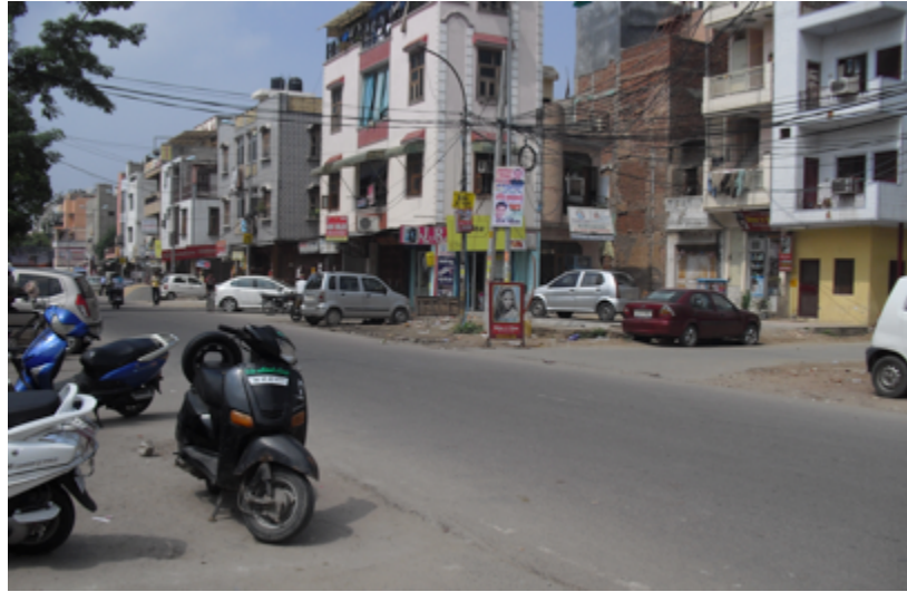
Figure 3: An example of a school surrounded by a residential area. This photograph was taken from the front entrance of a school. 40% of schools were located in residential areas similar to the one shown here.