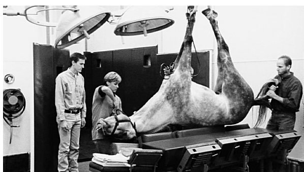
Figure 3. Strut is suspended. Courtesy Robinson Devor, director of Zoo , THINKFilm, 2007