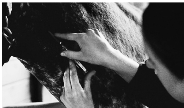
Figure 2. Strut is anesthetized.