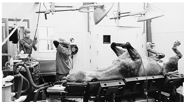
Figure 4. Strut is placed on a respirator. Courtesy Robinson Devor, director of Zoo , THINKFilm, 2007