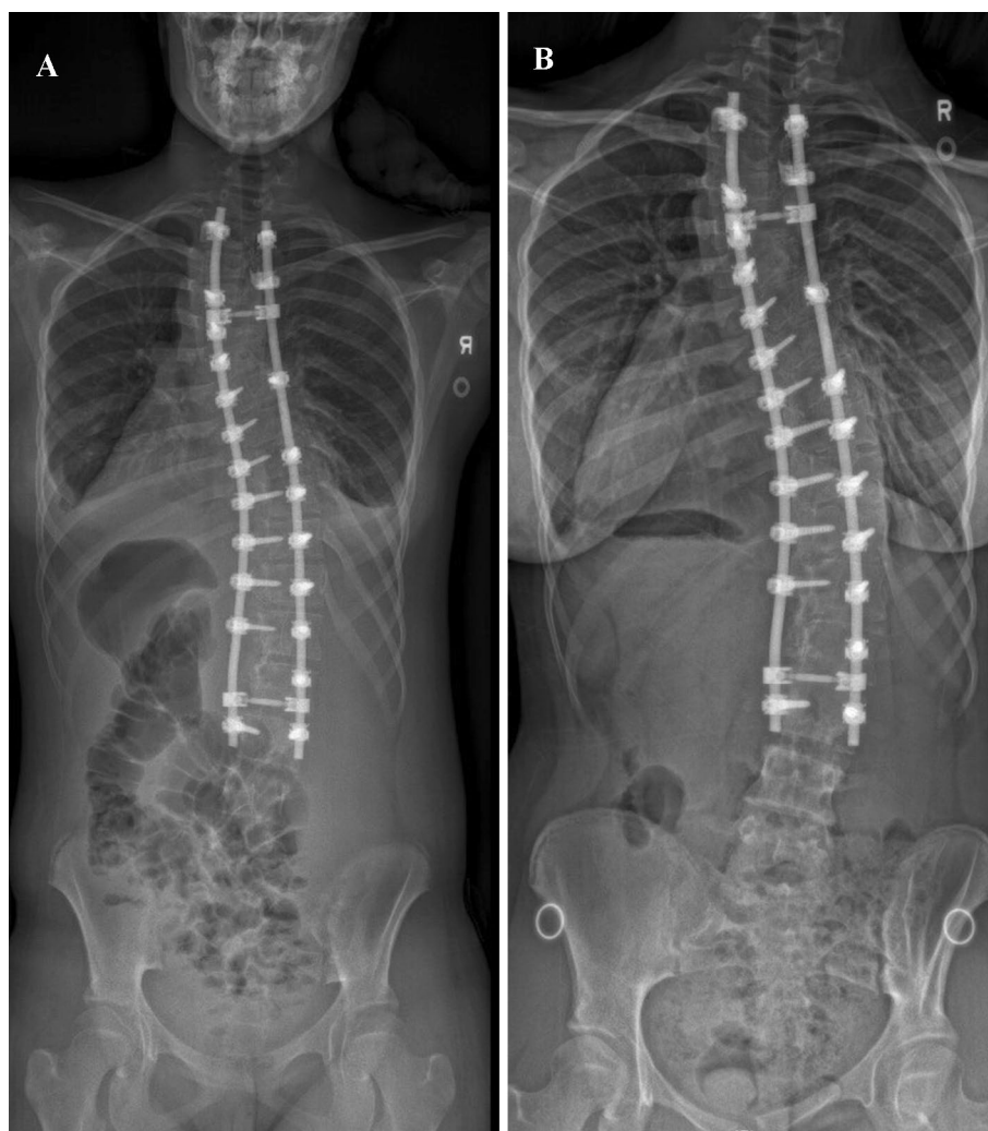
Fig. 2 A The patient has undergone posterior spinal fusion (T2–L3). Preoperative radiographic shoulder height difference (RSHD) was -19.8 mm. Postoperatively, the residual shoulder height difference was -21.4 mm which deteriorated by final follow-up at 2 years ( B ) (Case 2)

The mean preoperative PT Cobb angle was 32^\circ , 18^\circ immediately postoperatively, 17^\circ at 6 months postoperative, and 17^\circ at final follow-up (Table 2). The mean preoperative MT Cobb angle was 76^\circ , 21^\circ immediately postoperatively, 21^\circ at 6 months postoperatively, and 22^\circ at final follow-up. The