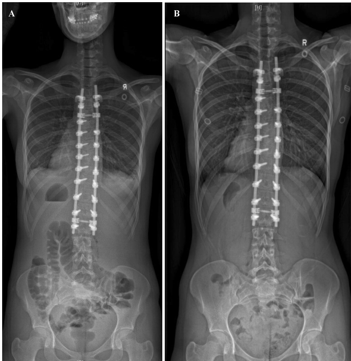
Fig. 3 A shows a patient who underwent posterior spinal fusion (T4–L2). The immediate postoperative RSHD was -14.0 mm. B Balanced shoulders (RSHD of 0 mm) at 3 years postoperatively (Case 3)

Perfectly symmetrical shoulder balance is rare, with Akel et al. finding a mean height difference of 7.5 \pm 5.8 mm between shoulder in the normal population [22]. Postoperative shoulder imbalance is difficult