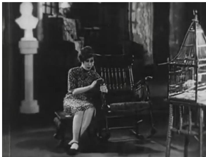
Figure 9. The songstress sits and sings in her room.