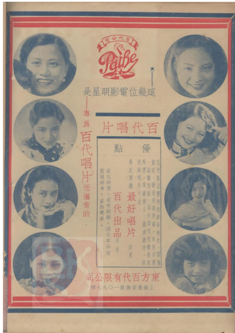
Figure 1. Advertisement of Pathe Record Company