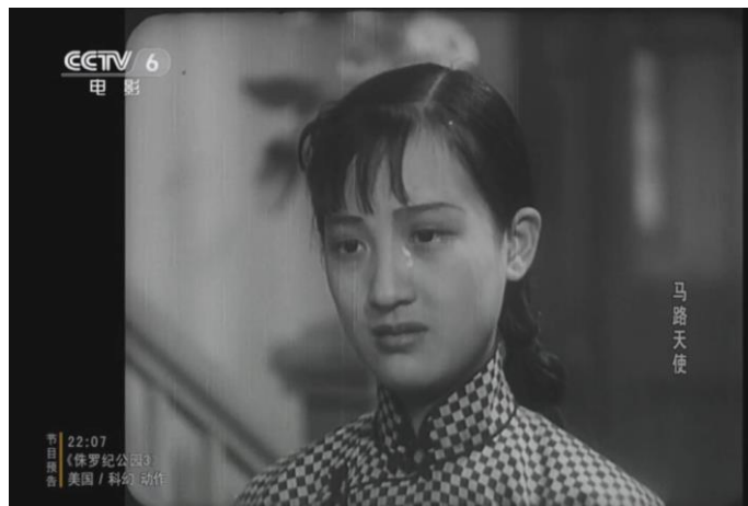
Figure 4. A close-up of her crying face.