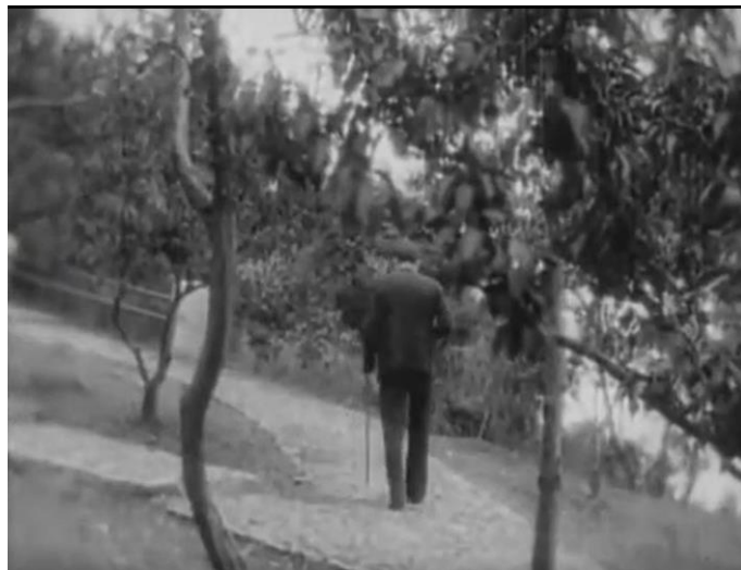
Figure 8. Close-up of the man from behind.