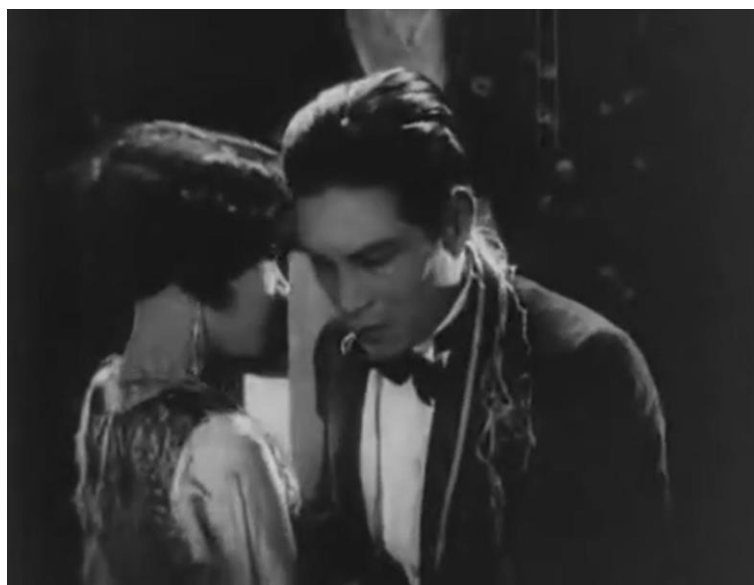
Figure 11. The man refuses to kiss the girl.

With such a self-reflexive awareness of her own extradiegetic identity, the female singer plays a more active role in her intimate relationship with the man. In the garden, when the two lovers hug and get closer to kiss, the man, thinking of his own wife, suddenly turns his head away, even though the woman is eager for his kiss (Figure 11). In this scene, the woman's desire is more genuine and stronger, while the man is much more self-constrained, especially after listening to the songstress's sorrowful song. This film also devotes more scenes showing how the woman "counter-gazes" at the man instead of the contrary. For example, during their first encounter, the woman curiously fixes her eyes on the handsome man, but the man does not see her. This female counter-gaze again reflects strong female agency and desires.