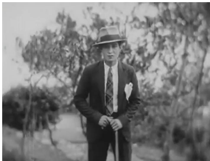
Figure 6. The hero stares at the songstress' house.

house and listening to her singing (Figure 6). The camera zooms in to make a close-up: the man stares at the house and frowns, his lips quivering and his eyes saturated with deep grief (Figure 7). After listening for a long time, he finally turns around and leaves, with the camera panning his fading image from behind (Figure 8). During this process, several scenes of the interior space of the house set in, presenting the female singer sitting beside a table and singing (Figure 9). Notably, compared with the long take on the man, scenes of Yueying are much shorter. Moreover, the camera makes clear close-ups of the man's facial expression to show his strong emotions, but scenes of the songstress are almost static—only the movements of her mouth indicate that she is singing. These differences show that the narrative concentrates more on the female voice, which is accompanied by a live band, and its impact on the man. The man's final decision to leave without letting the woman know indicates that the female voice has become inaccessible to the male gaze. This woman, singing without being seen, disrupts the specular regime of the female body. The ending illuminates how the narrative and the camerawork split the female voice with the image.