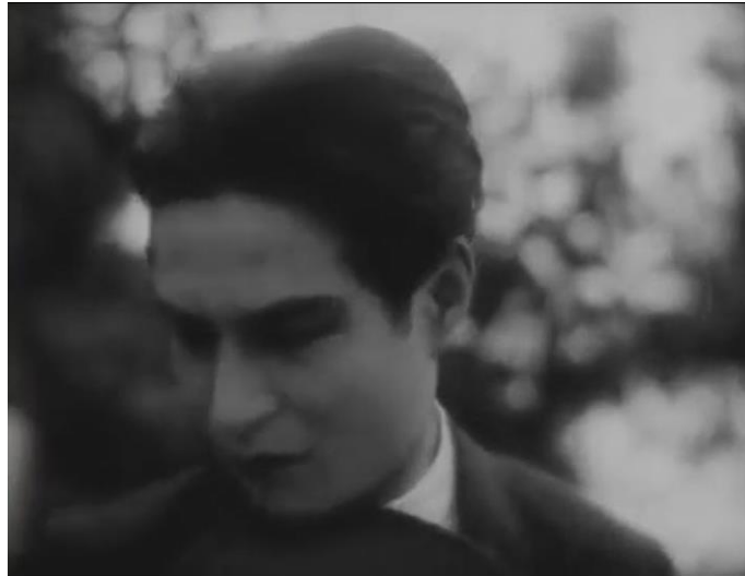
Figure 7. The man turns his head away.