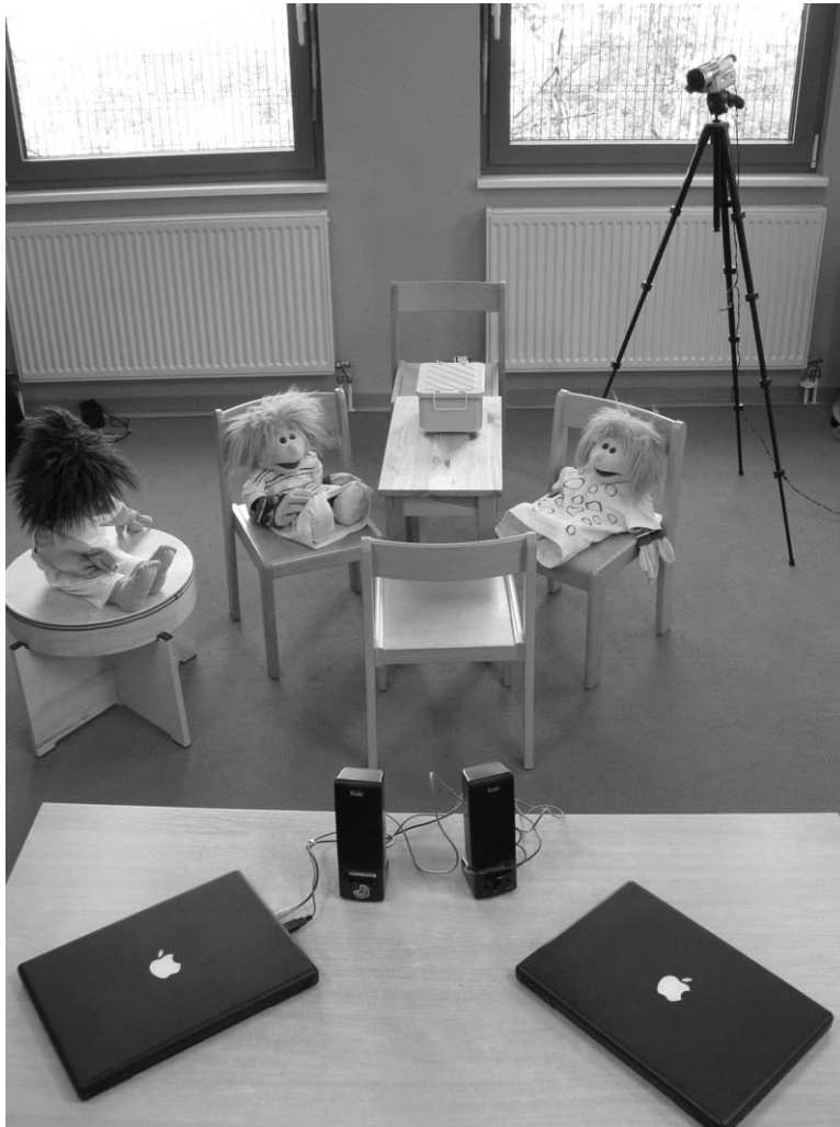
FIGURE 1 Setup of the study in a day-care center