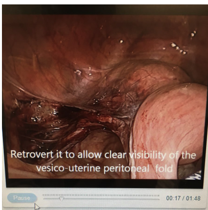
FIGURE 2 Instructional video tutorials

LapMentor (3D Systems Healthcare, Littleton, CO) virtual-reality trainer displaying video tutorial of laparoscopic hysterectomy.