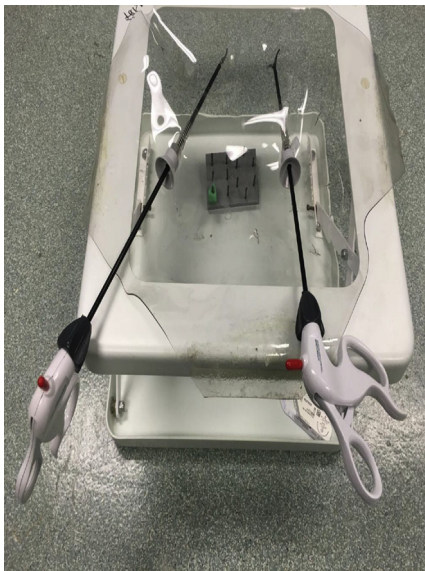
FIGURE 1 Low-fidelity laparoscopic simulation

Laparoscopic box trainer with peg transfer exercise and 2 laparoscopic instruments.