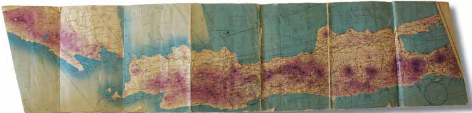
Full view and close-ups of map of islands of Sumatra and Java from World War II from my grandfather, Herman Arens , collection of artifacts (additional close-ups on next page). Note the handwritten notes and stamps from during the war in the close-up images.