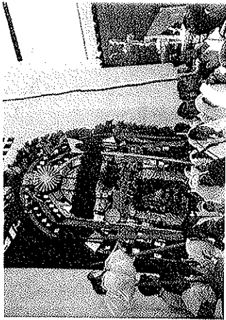
Virgen de Tránsito, Our Lady of Assumption, ensconced in her magnificent frame, exits the Joyabaj church to take a turn about the town. August 15, 2003.