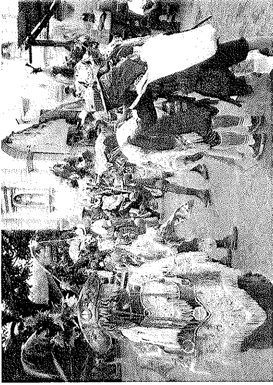
Baile de la Culebrón, Dance of the Serpent. In the right foreground the figure in the straw hat is the Maxe from Chichicastenango who has doubled over the worker in front of him to use his back as a table for noting down his debts.

ization of everyday life (the debt notebook) and its magic. They are about embody/meant (the corporeal) and enjoy/meant (in both the sense of pleasure and, more fiercely, jouissance ). They conjure unexpected allies, like the snake, not all of them human, and sudden, deadly reversals. The dances and this book are about relations between the highlands and the rest of Guatemala and with other parts of the planet. They are also about class, ethnicity, and gender, which are not things but relations — relations that accumulate capital. David Harvey, drawing on Rosa Luxemburg, calls them two-faced. One face consists of the everyday economic processes like those depicted in the baile , in factories or agricultural estates and mediated by transactions between capitalist and laborer. The other face is the rapacious and brutal “accumulation by dispossession” between capitalist and noncapitalist modes of production mediated via colonial policy, the international loan system, and war (2003:137). The dances are ways to co-memorate, or remember together, the experiences of dispossession and collective action. They contemplate the failure of that action to reach its immediate goal, all in the midst of ongoing exploitation and danger. They play with masks, truth, and power, and in that spirit I’ll situate the end of war (its conclusion) by telling a story about some ends (or goals) of people who participated in a rebellion similar to that of