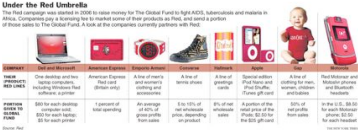
Figure 3: New York Times graphic