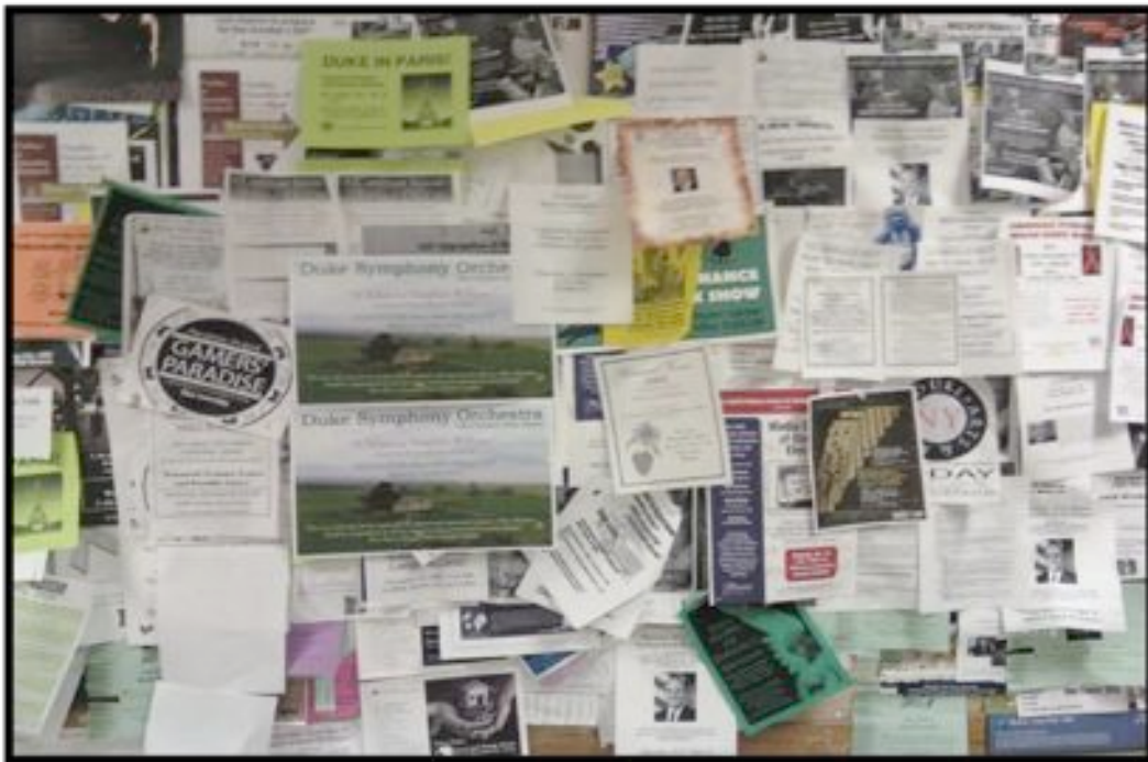
Figure 4: Photo by author

Perhaps another interesting way to view Duke students is through the lens of cultural anthropology's half-sister; archaeology. What are the precious relics that the students leave behind? Empty bottles of Gatorade, crushed cans of Busch Light beer stuck in corners besides mashed red plastic Solo cups, and of course, the litany of flyers that seem to cover every square inch of free bulletin board space on campus. Every day, hundreds of flyers printed in every shade of the rainbow are stapled and taped onto various boards, walls, even bathroom doors, each flying clamoring to target a specific need, want, and desire of a Duke student.