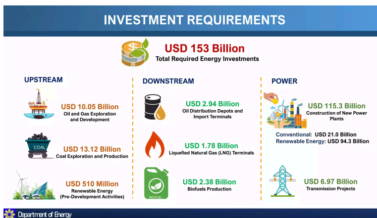
Figure 2: Investment Requirements for a Sustainable and Clean Energy Future in the Philippines

In order to reach net-zero emissions by 2050 (the target that climate scientists agree upon to limit warming to 1.5 C), annual investments in clean energy in emerging and developing economies must increase from just $150 billion US in 2020 to more than $1 trillion US by the end of the decade (IEA, 2021). The International Energy Agency (IEA) found in 2012 that roughly 55 percent of energy transition finance will need to be allocated to distributed systems. Meanwhile, the Philippines requires over 153 billion USD for its clean energy transition (Fuentebella, 2022). Of this, the DOE has identified 62 percent ($94.3B) to be allocated toward the construction of new RE power plants, but over $48 billion is allocated to oil, gas, coal, and conventional power development, as seen in Figure 2 below (Fuentebella, 2022).