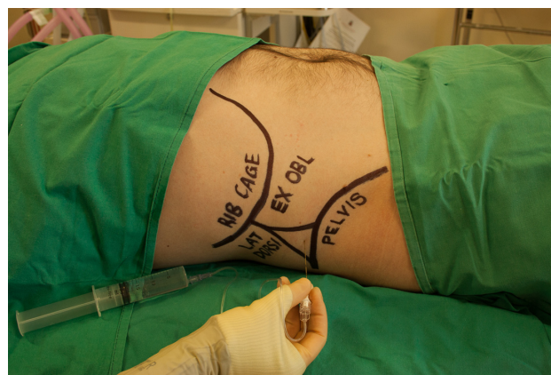
Figure 2 Surface anatomical landmarks used in transversus abdominis plane block. Note: Reproduced with permission from Webster K. The transversus abdominis plane (TAP) block: abdominal plane regional anaesthesia. Update in Anaesthesia . 2008;24(1): 24–29. 13 http://www.wfsahq.org/resources/update-in-anaesthesia . Abbreviations: EX OBL, external oblique; LAT DORSI, latissimus dorsi.

of Petit in 2001. 12 Appropriate needle placement using the landmark technique resulted in a “pop” or “sensation of giving way”, which indicated that the needle had reached the fascial plane between the internal oblique and transversus abdominis muscles. 12 The technique, initially described as a field block or a regional abdominal field infiltration, was eventually referred to as a “TAP block”. 7,14 This technique was evaluated and modified through a series of cadaveric and healthy volunteer studies. 9,15–18 An alternative “double pop” method was described in which the needle is advanced perpendicularly until the first pop is felt in between the external and internal oblique muscles, and then advanced again until a second pop is felt, indicating entry into the transversus abdominis fascial plane. 6,18