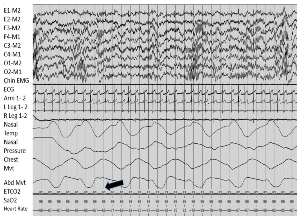
Figure 2. Hypercapnia in muscular dystrophy. This figure, from a polysomnogram of a child with Duchenne muscular dystrophy, shows persistent elevated CO 2 levels during sleep noted by the arrow.

OSA is the predominant phenotype of sleep disordered breathing at younger ages and sleep-related hypoventilation is present in most patients with DMD at older ages, but there is significant overlap given risk factors for obesity and variability in progression of muscle weakness [96,97]. Obesity has been associated with worsened OSA. Additionally, obstructive apnea index in patients with DMD is worse in REM sleep when compared to non-REM sleep [97], which probably is related to diaphragm weakness in this population. In one study classifying patients as OSA, CSA, or sleep related hypoventilation, patients with an increased forced vital capacity (FVC) had increased odds of OSA while patients with a reduced FVC had increased odds of hypoventilation [97]. Steroid therapy in young boys with DMD may contribute to increased obesity and OSA prevalence prior to the onset of sleep related hypoventilation [97].