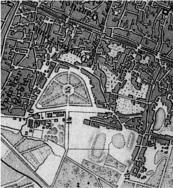
Figure 1: Azbakiyya in the 1850s. A. Joanne and É. Isambert, Itinéraire descriptif, historique et archéologique de l'Orient (Paris, 1861), detail.

might have been ordered for reasons of public hygiene 29 but also coincided with Ibrahim Pasha (r. 1848), Mehmed Ali's heir, ordering the extensive planting of trees, levelling the ground and building palaces nearby. 30 Schools continued to be built in the 1850s, and Said Pasha (r. 1854–63) ordered the resupply of water to the new square. 31 Female prostitutes and dancers were banished from Cairo in 1834 (although not their male counterparts); later in the 1850s, they were permitted to return. 32 The new garden became a popular promenade, 33 and hotels catering to European