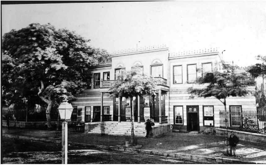
Figure 4: Comédie (E. Bécharde, 1874).

playhouses 104 with the exception of the Opera. 105 The music theatres were concentrated within a small territory on the south side of the Azbakiyya Garden. The first one, a Comédie, faced a police station ('Zaptiyye' ( Zabṭiyya )), which might have been instrumental in the direct supervision of pleasure. It was built by demolishing the ruins of Ahmed Tahir Pasha's palace. 106 The building itself had a curious look because it indeed resembled a palace. It contained '116 stalls, 46 orchestra stalls, 18 pit boxes, 18 first class boxes and 18 second-class boxes', with some screened boxes for the harem, 107 beautifully ornamented. 108 The inaugural performance by Manasse's French operetta troupe from Istanbul took place on 4 January 1869 (Figure 4).