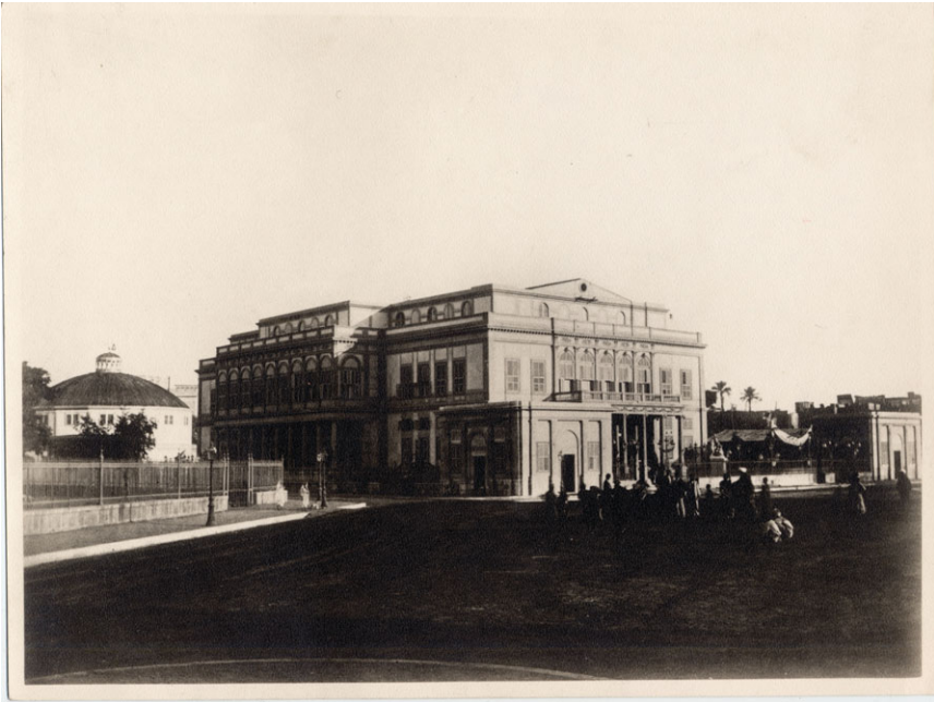
Figure 5: (Colour online) Khedivial Opera House and the Circus, around 1870, unknown photographer (perhaps E. Béchard?). Collection Max Karkégi, with permission.

urban change and the creation of symbolic western European imperial entertainments, Cairo also became the uncontested cultural capital, not only of Egypt, but of the whole Ottoman Arab world, joining the international market of the opera/theatre business. Its Opera especially served as a school for educating and disciplining a new urban elite, be they Egyptian Turks, Arabs, Jews, Armenians, Greeks or Italians.