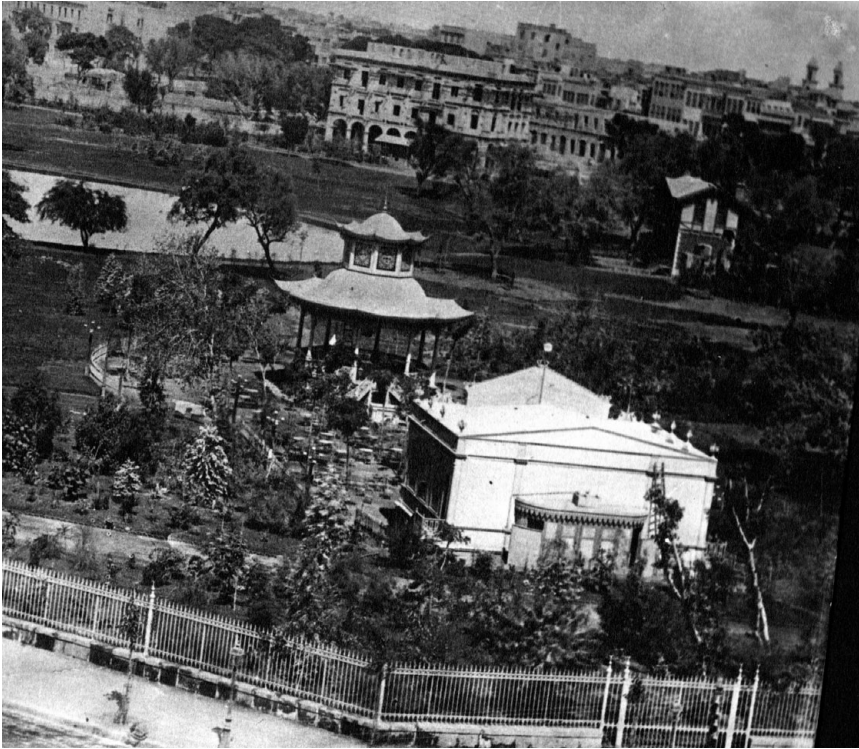
Figure 6: Théâtre-Concert du Jardin de l'Esbekieh, around 1872

version of Arab modernity offered by Syrians represented a potential khedivial Arab façade for his heir, Tevfik, in the colonial atmosphere of the 1880s. In order to mark themselves as 'patriotic', Syrians allied with Egyptian singers, thereby forging a particular type of interregional music theatre in Arabic. The most successful such alliance was the collaboration between the Syrian impresario Sulayman Qardahi and the Egyptian singer Salama Hijazi, first in the spring of 1882, performing at the Opera House for the patriotic 'Urabi Pasha. After the British suppressed the 'Urabi-revolt, in the second half of the 1880s, Qardahi and Hijazi achieved enormous success together with the support of Khedive Tevfik. During these years, symbolically embodying the continuity of old and new Azbakiyya, the singer 'Abduh al-Hamuli also returned from private khedivial service to the public, with regular concerts at the Opera House. By attending these patriotic ( waṭani ) occasions, ordinary Egyptians, Syrians and the self-nationalizing Ottoman Egyptian elite often expressed political opposition