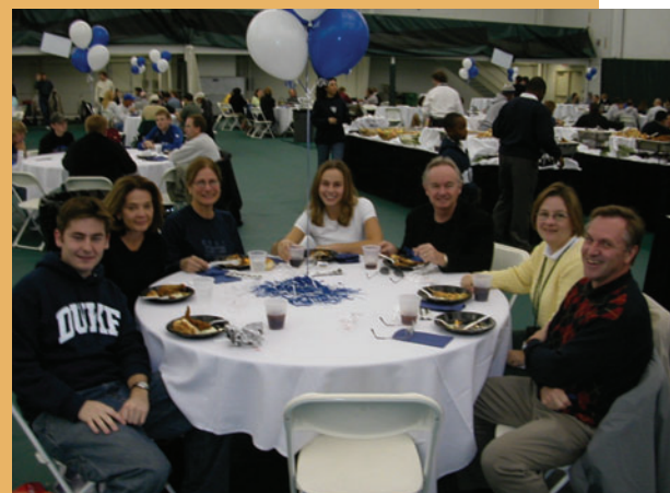
Pre-Game BBQ — Parents' & Family Weekend 2003

University. She is an active member of Delta Sigma Theta sorority and serves as a role model and mentor to first and second grade girls in Durham, N.C. Her hometown is Atlanta, Georgia. ■