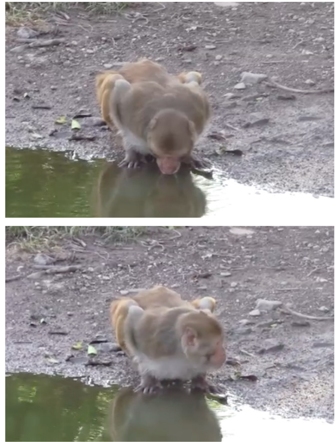
Figure 1. Costs and benefits of vigilance behaviour in free-ranging rhesus macaques. Top: drinking necessitates a head-down posture incompatible with vigilance behaviour. Bottom: animals periodically interrupt drinking to monitor their surroundings. This male, 29H, was vigilant during 47.6% of the filmed drinking bout.

Because the visual targets of vigilance could not be identified by the investigators, we established criteria in order to differentiate between vigilance and nonvigilant resting states. We wanted to ensure that behaviour coded as vigilance in our study was restricted to behaviours in which the monkey appeared to be actively gathering information about the environment, rather than passively resting while staring off into the distance. To do this, we encoded all head swivels, characterized by a turn of the head at least 45 degrees from the current position. We then calculated the duration of all putative 'looking bouts', defined as the time intervals