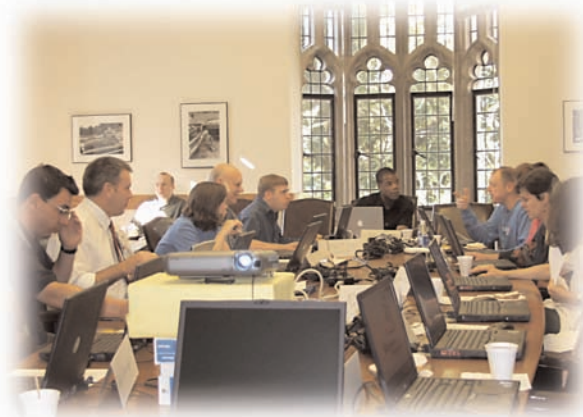
CIT Fellows engaging in discussion on technology

Instructional Technology Fellows will serve as a resource for technology planning within their departments and will demonstrate their projects at the CIT Instructional Technology Showcase next April.