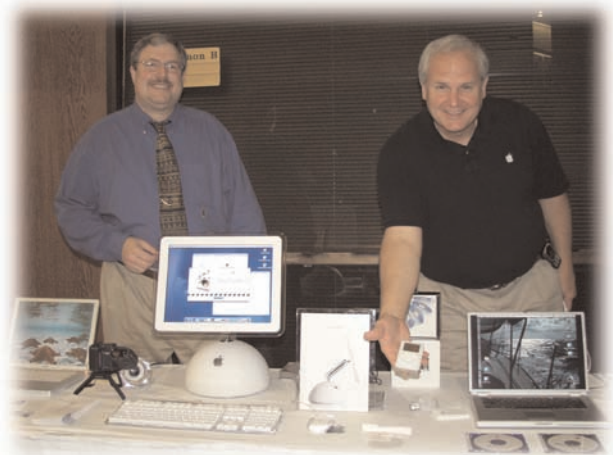
Apple vendors exhibiting the latest technology at the Spring Instructional Technology Showcase

special pricing on 20 iPod devices in support of a CIT incentive grant project exploring the use of student digital video projects and mobile computing.