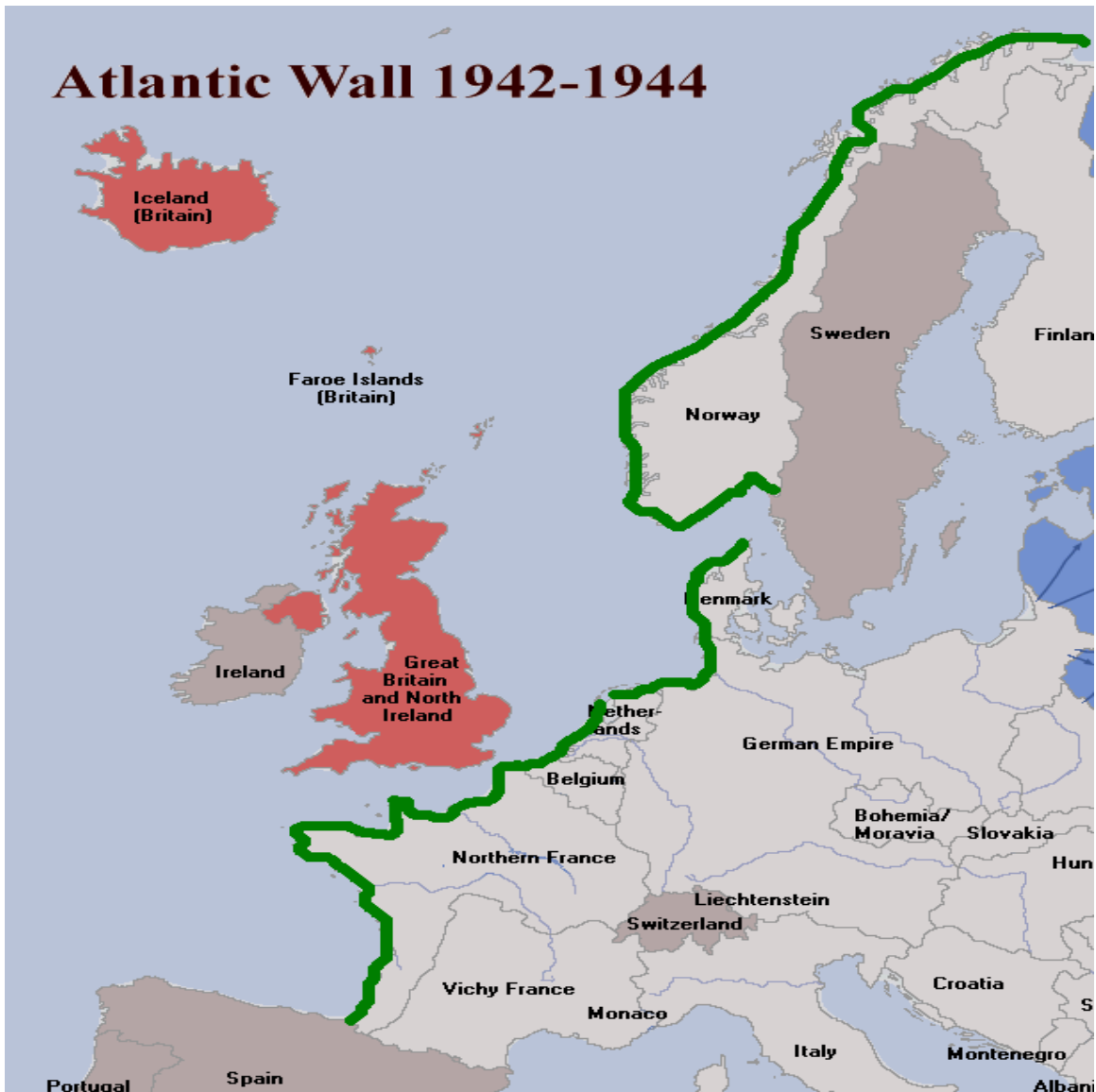
Figure 1: Visual of the scale of Hitler’s Atlantic Wall stretching from Spain to Norway 135

A thinly stretched defense force was a fact that was known well by Hitler’s commanders. The forces on the coast of Normandy were part of the LXXXIV Infantry Corps, commanded by General der Artillerie Erich Marcks. In their book Overlord: The D-Day Landings , Ford and Zaloga explain that Marcks did not believe that it was feasible to defeat the Allies on the beaches