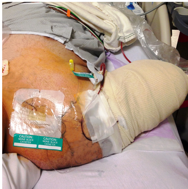
Figure 1 Patient who had suffered a traumatic amputation of the mid-humerus following a motorcycle crash.

Continuous peripheral nerve block (CPNB) techniques prolong the duration of analgesia well beyond 16–24 hours that can be expected from a single-injection nerve block with long-acting local anesthetics such as ropivacaine or bupivacaine. The pain intensity associated with trauma is often severe and longstanding, making CPNBs a useful tool. Catheters can be left in for days to weeks, depending on the indication. Patients with complex injuries that require repeated debridement, fracture fixation, and/or skin grafting frequently benefit from such long-term catheterization (Figure 1). The pumps can be programmed to deliver a background infusion of a low concentration, long-acting local anesthetic (eg, 0.1%–0.2% ropivacaine) while on the floor or intensive care unit (ICU), and the catheters manually bolused with a higher